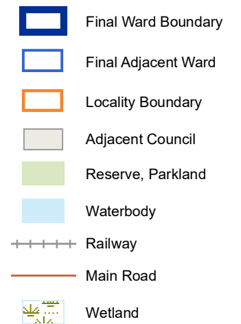
Location Map Coorparoo