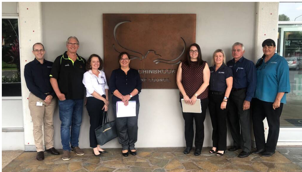
Earlier this year ECQ staff visited Hinchinbrook Shire Council in Far North Queensland as part of the election engagement program.

Election preparations are well underway and councils can expect ongoing communication about their local service design in the lead up to the 2024 elections.