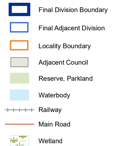
Location Map Division 7