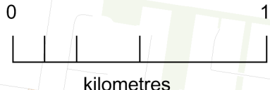
DIVISION 6 Location Map