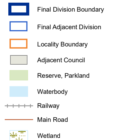
Location Map Division 6