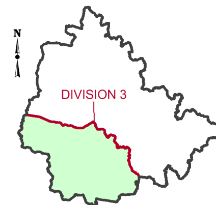
DIVISION 3 Location Map

DISCLAIMER While every care has been taken to ensure the accuracy of this product, the Electoral Commission Queensland (ECQ) makes no representations or warranties about its accuracy, reliability, completeness or suitability for any particular purpose and disclaims all responsibility and all liability (including, without limitation, liability in negligence) for all expenses, losses, damages (including indirect and consequential damage) and cost which might be incurred as a result of the data being inaccurate or incomplete in any way and for any reason.