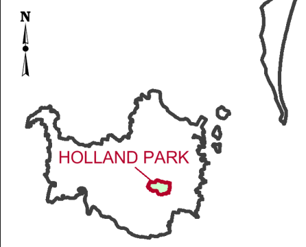
HOLLAND PARK Location Map Brisbane City Council

DISCLAIMER While every care has been taken to ensure the accuracy of this product, the Electoral Commission Queensland (ECQ) makes no representations or warranties about its accuracy, reliability, completeness or suitability for any particular purpose and disclaims all responsibility and all liability (including, without limitation, liability in negligence) for all expenses, losses, damages (including indirect and consequential damage) and cost which might be incurred as a result of the data being inaccurate or incomplete in any way and for any reason.